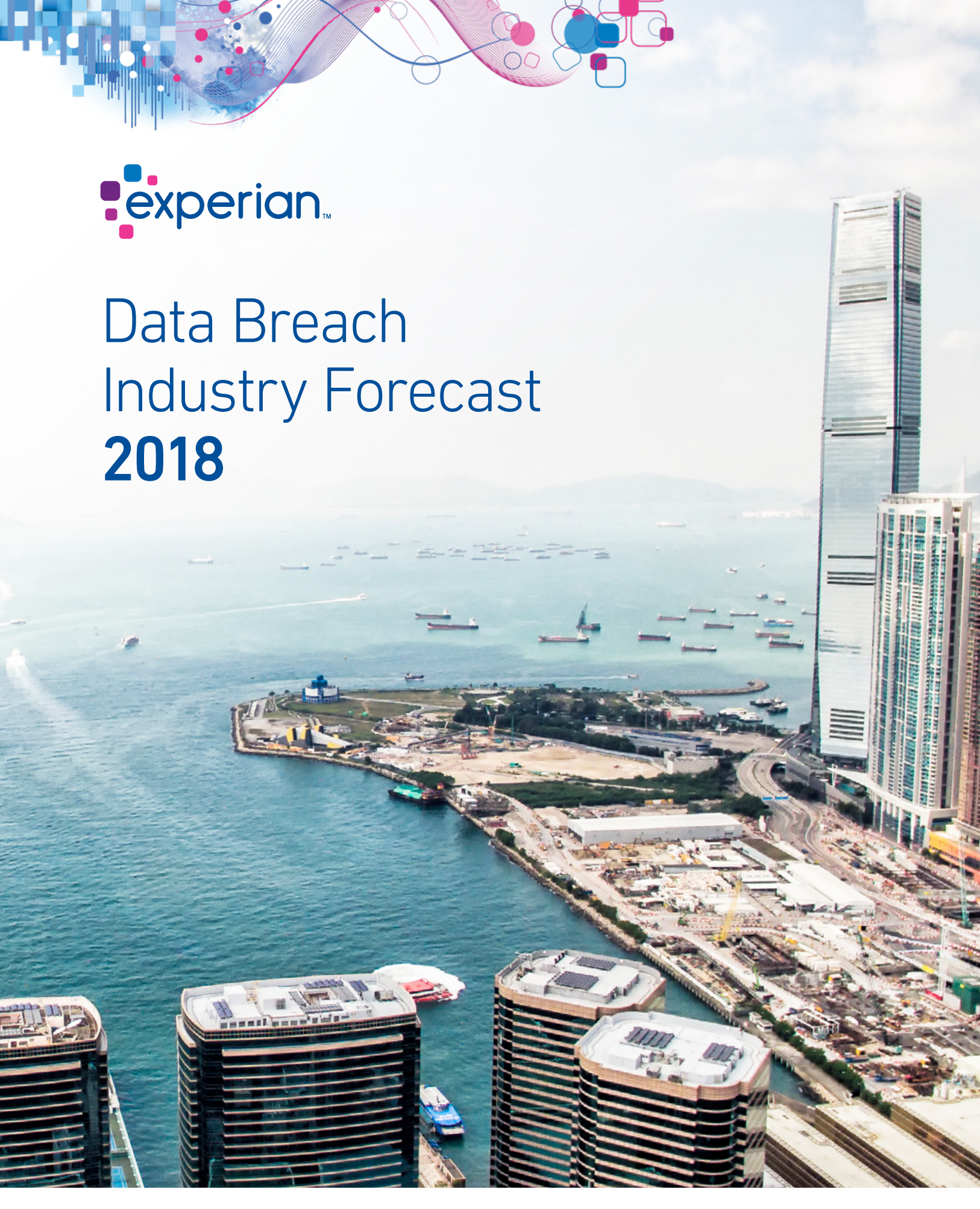
By Experian Data Breach Resolution • 2018 Edition